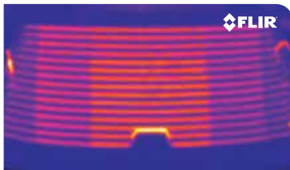
Inspection of a windshield defroster for damaged electrical elements.

The FLIR A315 can be ordered with an environmental housing. The housing increases the environmental specifications of the FLIR A315 to IP66, protecting the camera's from dust and water without affecting any of the camera features. The housing is available for cameras that are equipped with a 25°, 45° or 90° lens, and can be ordered separately as an accessory.