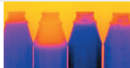
Detecting liquid levels in visually opaque bottles.